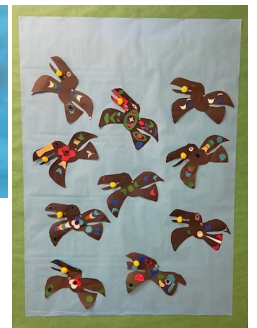
Creatures in the computer lab.